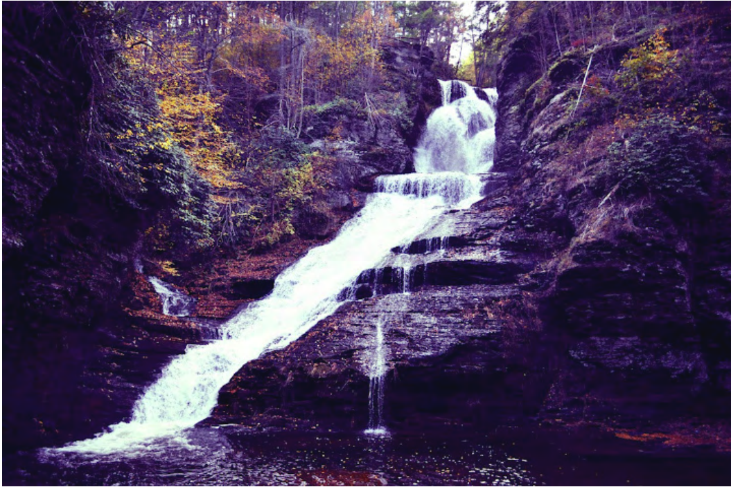
Untitled Liana Florez 2015