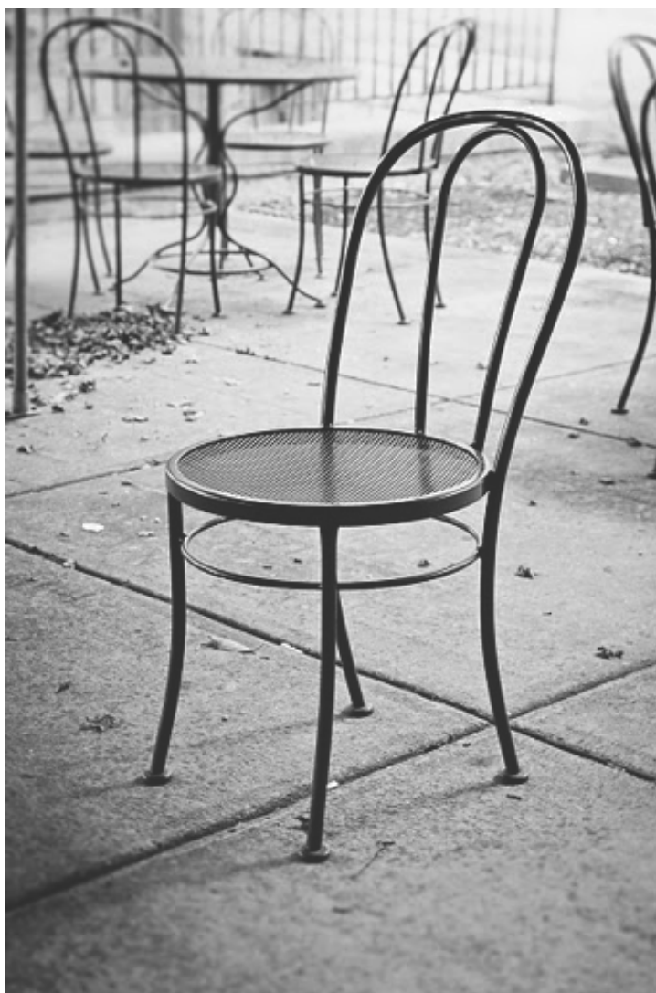
Untitled Kirk Martyn 2014