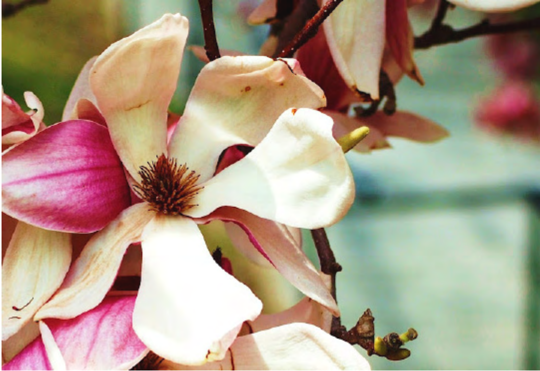
Untitled Jessica Veazey 2013