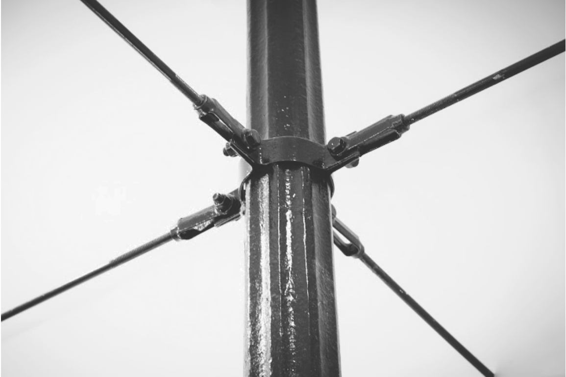
Untitled Kirk Martyn 2014