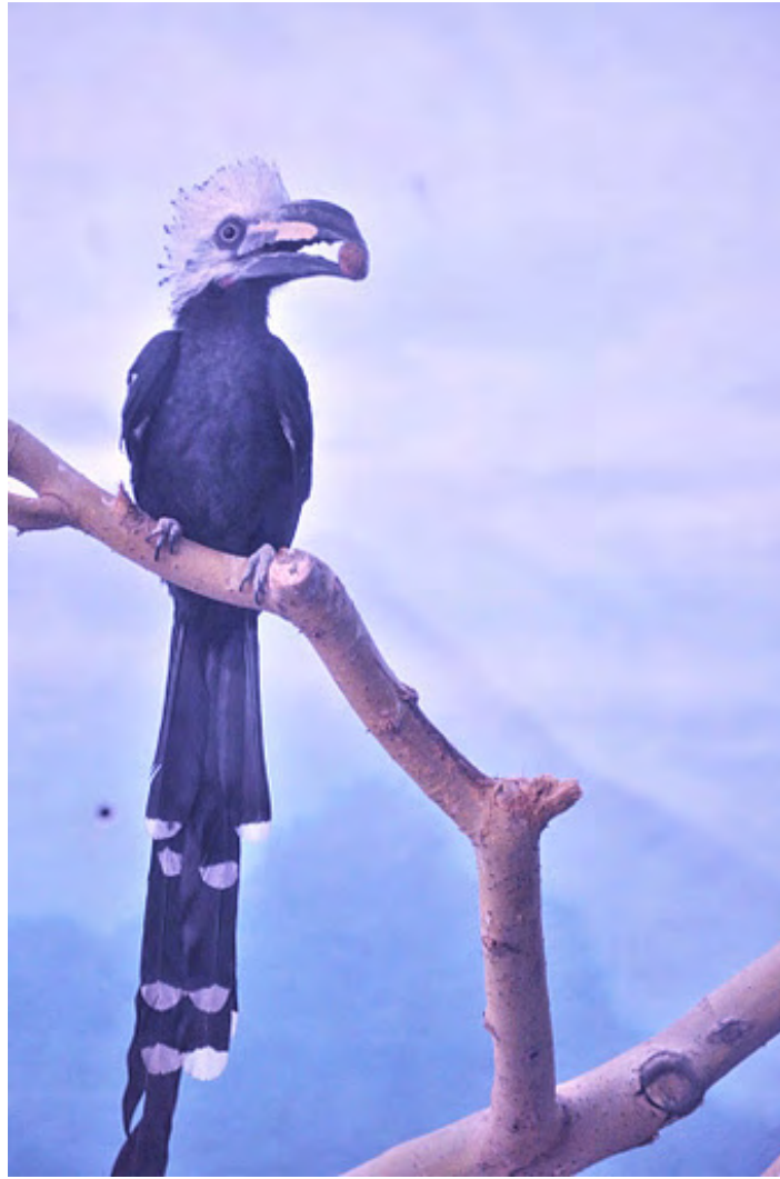
Untitled Liana Florez 2015