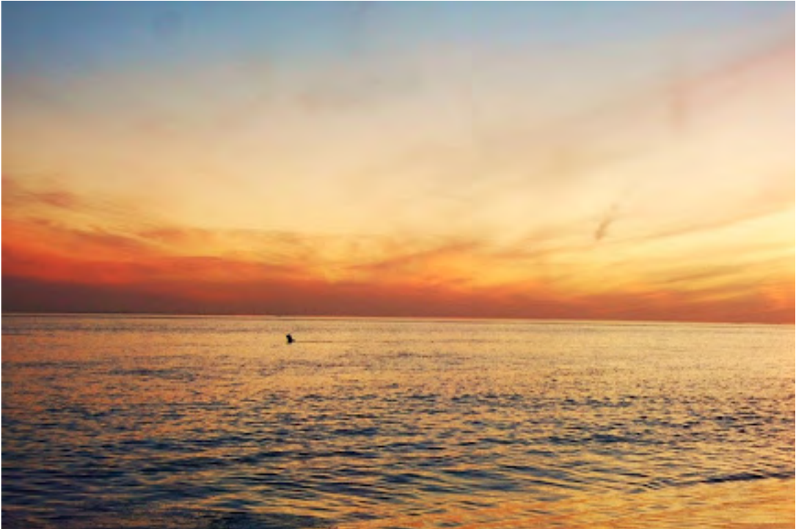
Untitled Jessica Veazey 2013