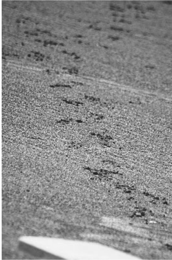
Untitled Jessica Veazey 2013