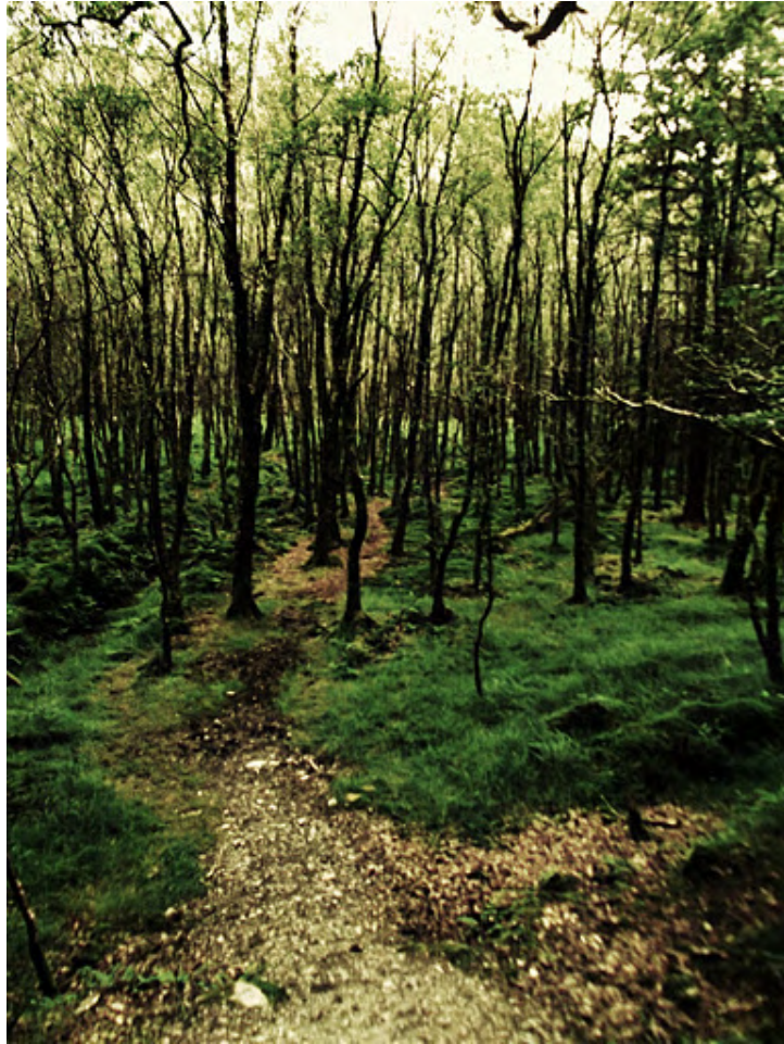
Untitled Jessica Veazey 2013