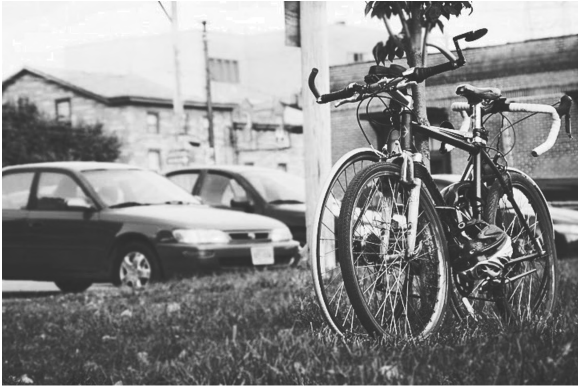
Untitled Kirk Martyn 2014