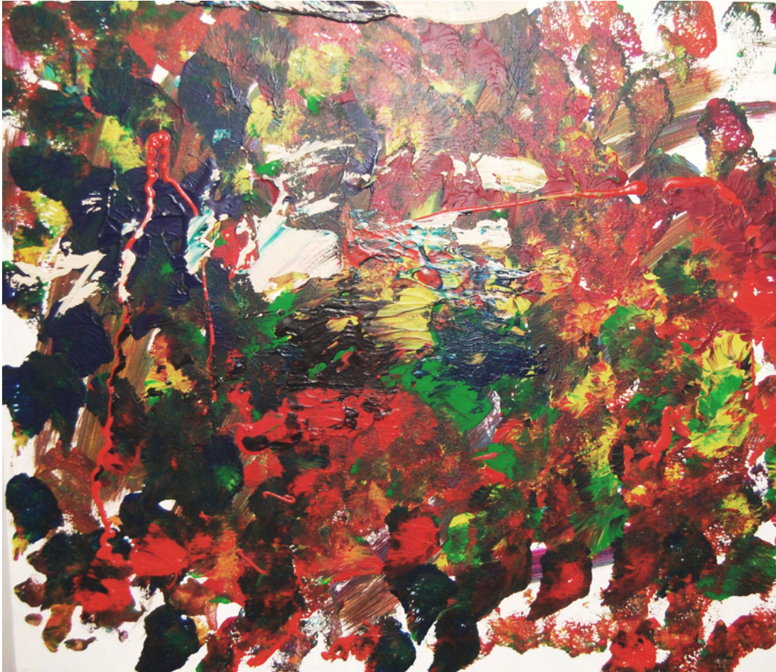
Untitled Travis Wolfe 2012