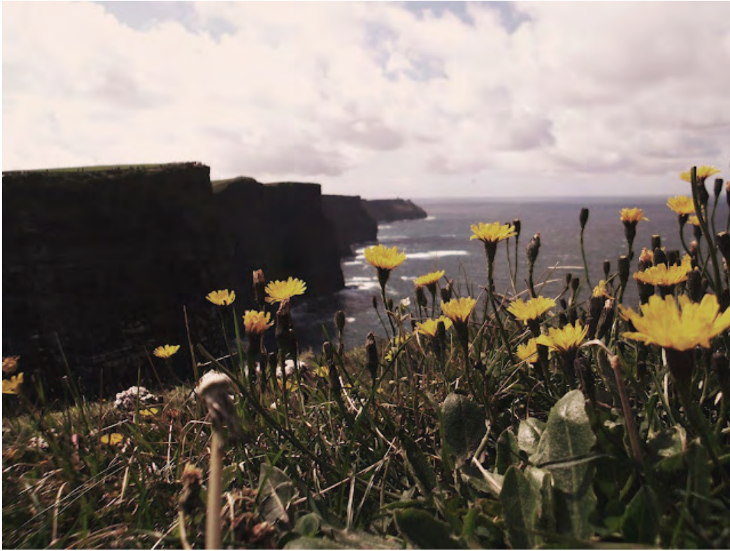
Untitled Jessica Veazey 2013