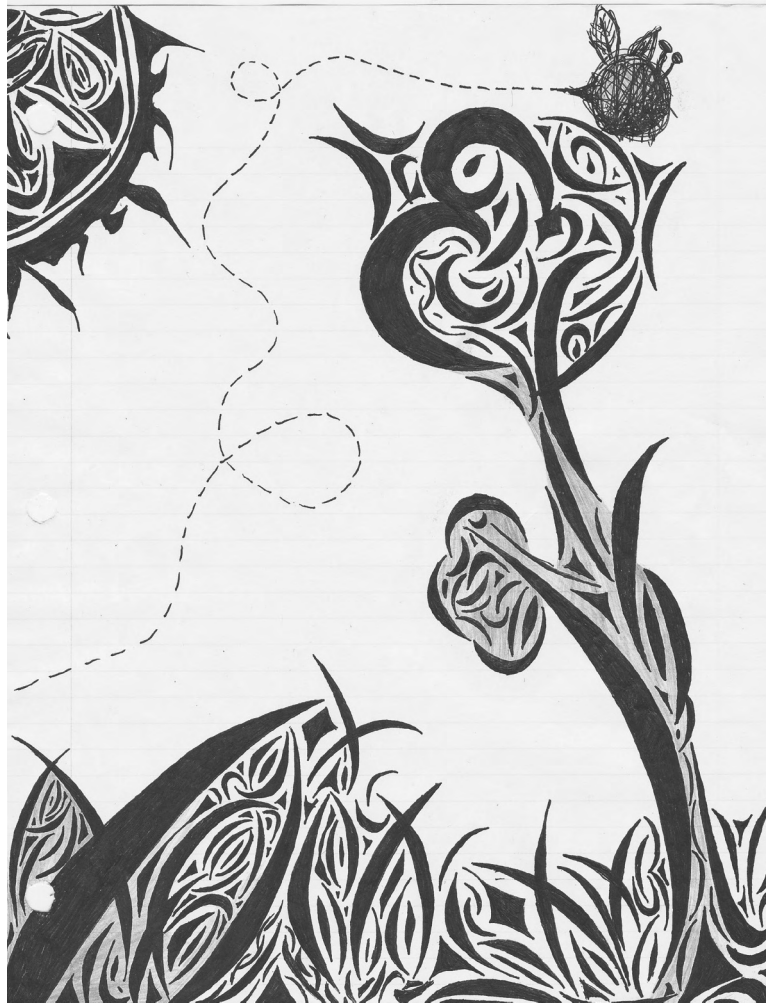
Untitled Amanda Beury 2014