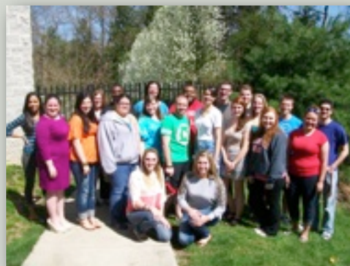
Residence Life Staff 2013-2014